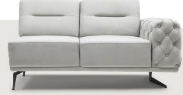
Three With Arm