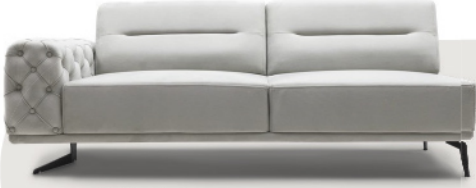
Three With Arm